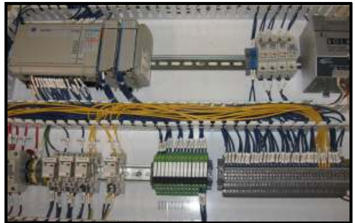
WebMax PLC Controller Sub Panel

WebMax uses ultrasonic smart sensors that monitor web movement and detect web breaks as soon as they occur. The use of ultrasonic sensors eliminates many common causes of false triggering found in photocell based systems. The use of smart sensor technology further eliminates false triggers from slime holes and web flutter. Up to 60 ultrasonic sensors can be installed with each WebMax system and up to four sensors can be installed in each sensor bar. Sensors can be laterally positioned within the web detector bar without tools. Web detector bars are installed on the press using either existing press frames or clamp mounted directly to idler roller shafts.