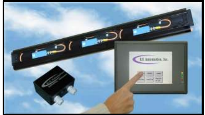
High Speed Ultrasonic Web Detection

U.S. Automation's WebMax has been protecting printing presses around the world for over a decade. Using the latest generation of ultrasonic sensor technology, the WebMax system instantly detects web breaks, simultaneously engages the press E-Stop circuit, and fires web severers before costly web wrap-up damage can occur. The WebMax system can store up to 36 user-created "jobs", which allows the system to be instantly re-configured for different web-up configurations. WebMax is simple to use and can be configured for the most basic of commercial press lines to complicated newspaper presses with many different web leads and multiple folders.