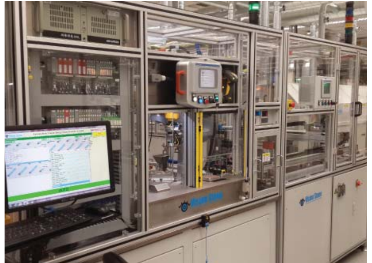
Vision Stone developed and installed a custom-made vision inspection system for TRW with multiple smart cameras from Microscan.

In addition, the correct position had to be determined before applying coating on the PCBs. It is difficult to ensure consistent coating quality with manual checks, as such