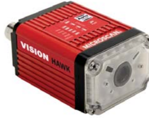
Vision HAWK Smart Camera

Vision Stone engineer Mr. Yingjie Zhu comments: “There are several reasons to choose Microscan products. Firstly, Microscan has a broad product portfolio, from barcode readers to machine vision products. For this system, we chose a barcode imager for traceability, and a smart camera to inspect the parts. In addition, Microscan offers industrial lighting for a complete solution. Microscan’s vision products are very easy to use, and we do not need to do extra work to communicate the results to a PLC or other industrial controls. In the future, Vision Stone will perfect the system and add even more vision inspection functionality.”