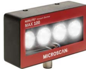
NERLITE MAX lighting