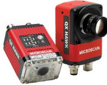
QX Hawk Industrial Imager