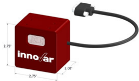
Custom IP52-rated packaging of Microscan MS-2D Engine with serial communication capability.