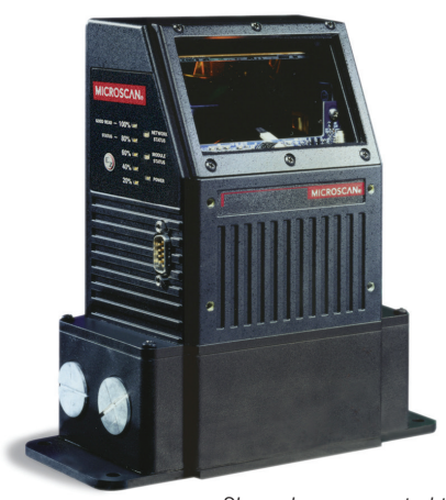
Shown here connected to the MS-890 Scanner

For more information on this product, visit www.microscan.com.